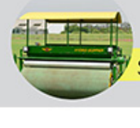
SUN / RAIN ROOF