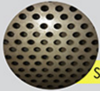
STAINLESS STEEL FOAM WHEELS