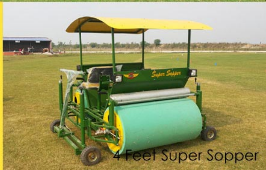
4 Feet Super Sopper